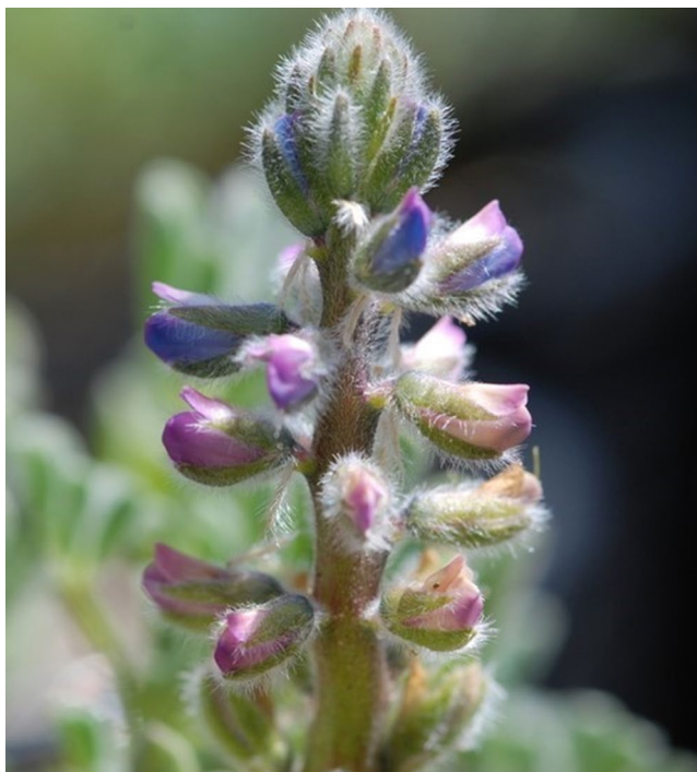
FIGURE 1 Flower peduncle of Lupinus nipomensis Eastw. (Nipomo mesa lupine).

The reintroduction of Nipomo Mesa lupine, and other rare plants with a limited initial population size, requires specific abiotic conditions to maximize reproductive output from reintroduction efforts.