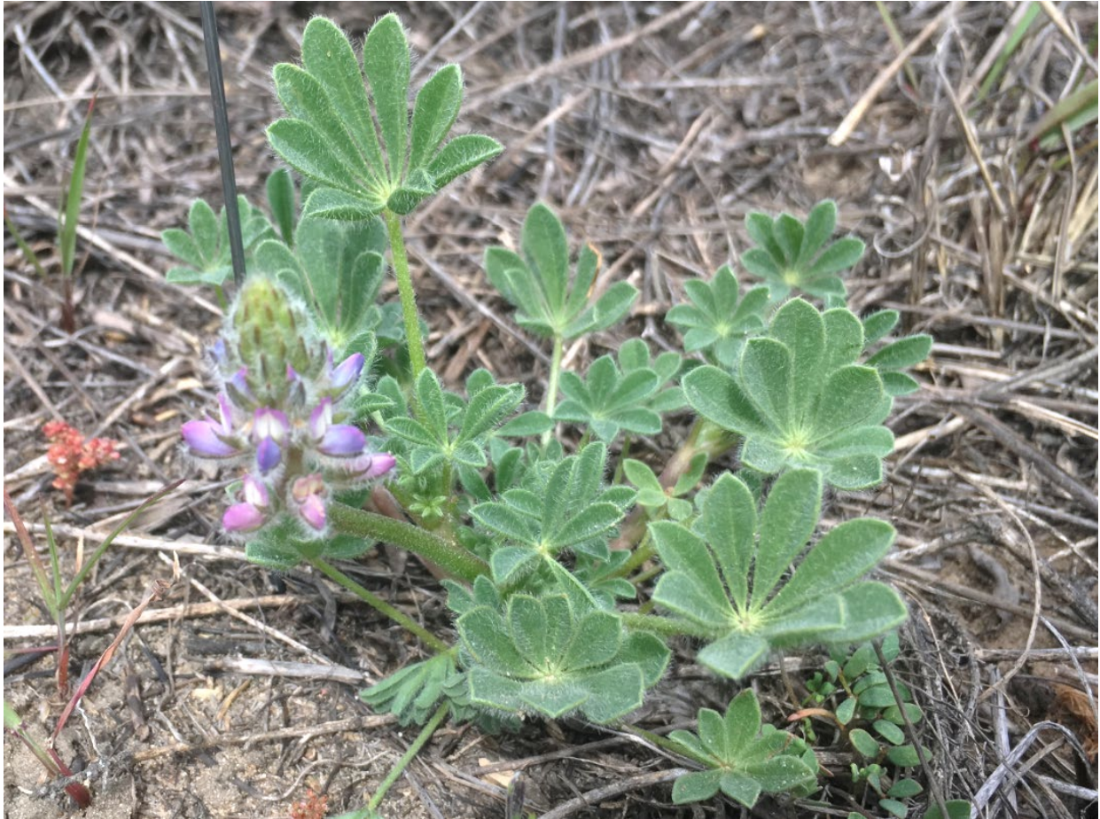
Nipomo Mesa lupine ( Lupinus nipomensis ) in bloom at Black Lake Ecological Area in San Luis Obispo County, California, March 19, 2019

U.S. Fish and Wildlife Service Ventura, California